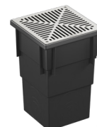
Series 300 Deep